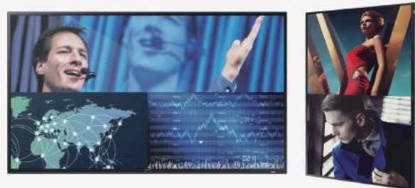
Figure 3. Split-screen display capabilities offer myriad usage scenarios.