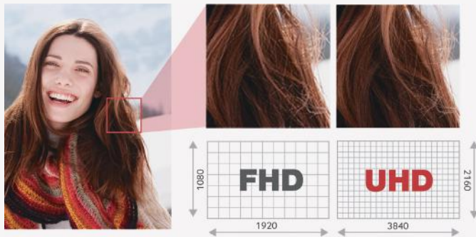
Figure 2. UHD high pixel density provides accurate detail representation.

QMD Series delivers four times the FHD resolution on the same screen area, resulting in the most accurate recreation of details possible. Text that displays on QMD Series in UHD is super-crisp due to its high pixel density. High-detail visuals, such as photos and videos, are visible with the smallest details for a hyper-realistic and immersive visual experience.