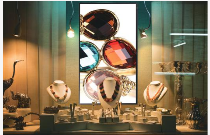
Figure 1. Commercial applications can leverage QMD Series clarity and operational capabilities.

Samsung QMD Series SMART Signage features a new design and delivers 3,840 x 2,160 resolution, multi-format PIP support, DP 1.2 support, set-back box (SBB) support, portrait or landscape orientation and reliable 16/7 operation for amazing flexibility and picture clarity in commercial settings. For example, retail stores can leverage Samsung QMD Series with UHD to improve their brand image and showcase products in sharp detail, while corporations and arena or museum security centers can use the high-resolution displays to enhance security with stable and vivid content playback.