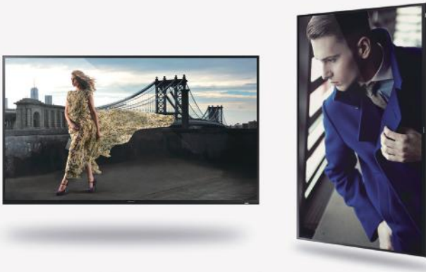
Figure 4. Pivot mode to fit the aesthetic setting while delivering dynamic content.

To meet the demands of traditional commercial environments, digital signage is often installed in portrait mode. Thus, it is critical that the digital signage supports portrait installation to fit to the aesthetics of the setting while still delivering the dynamic qualities of digital signage. QMD Series offers pivot mode that allows them to be installed in either landscape or portrait orientation to suit the environment's needs.